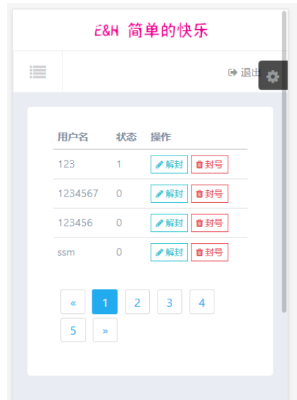
Figure 6 Administrator function interface mobile

Administrator function page of the mobile side of the page shows the administrator background functions, you can manage posts, manage comments, ban or delete users, add and delete categories, the left column will shrink up, the user wants to use when you can open the convenience of mobile use.