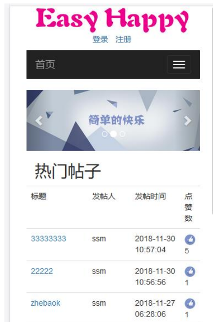
Figure 2 Mobile home page

The mobile and computer interface is the same, using Bootstrap responsive page development, you can distinguish the size of the screen when you visit, and then let the web page LOGO in the top center, categories and search bar will be hidden, only when you click, the following can also be seen with the computer side of the same popular posts and the latest posts.