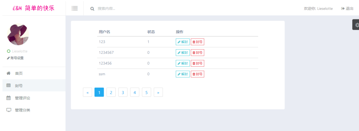
Figure 5 Administrator function interface

@RequestMapping(value = "admin/login.action") public String adminlogin(HttpServletRequest request, HttpServletResponse response ,String adminname,String adminpassword){ Admin user = new Admin(); user.setAdminname(adminname); user.setAdminpassword(adminpassword); Admin loginUser = userservice.adminlogin(user); if(loginUser!=null) { request.getSession().setAttribute("adminlogin", loginUser); return "forward:/admin/index.jsp"; }else {